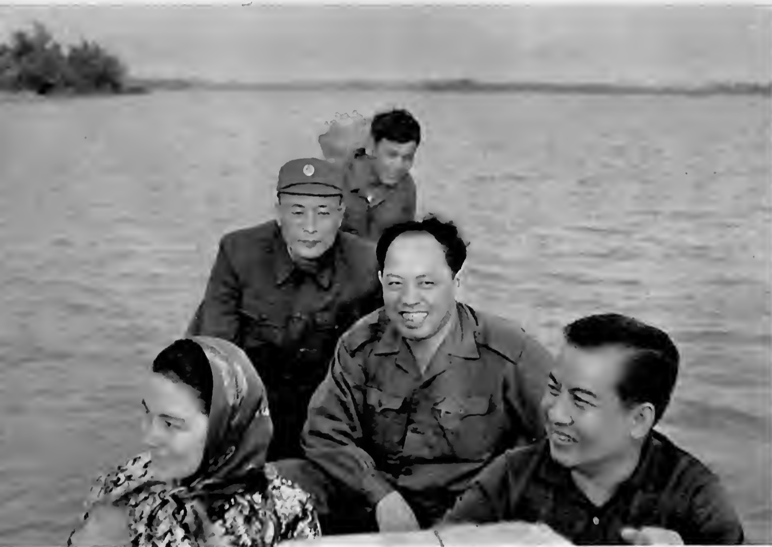
Crossing a river.